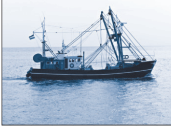
Search & Rescue