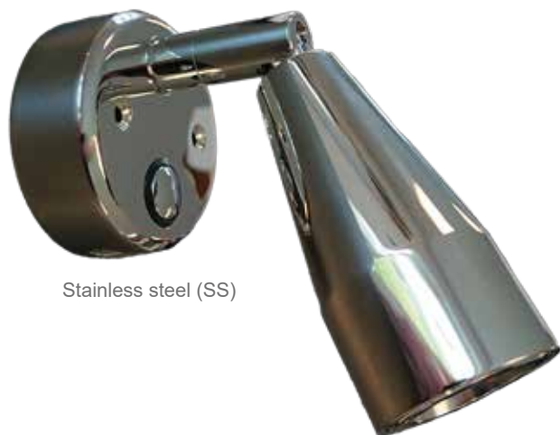
Stainless steel (SS)