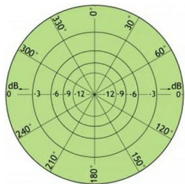
TYPICAL RADIATION PATTERN (H-PLANE)